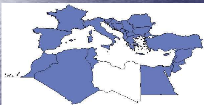
Figure 1: The EpiSouth Network

In 2005, the "Year of the Mediterranean", some European Public Health Institutes proposed a framework of collaboration for communicable diseases surveillance and training in the Mediterranean Basin. This initiative led to EpiSouth Project, co-funded by EU Public Health Programme (DG SANCO) and by Italian MOH (EpiMed Project). From an initial involvement of 9 countries, the EpiSouth network currently includes partners from 26 countries of South Europe, Balkans, North Africa and Middle-East, and from international organizations (EU, ECDC, and WHO (Figure 1). The Project's monitoring focused on Network Development (ND) and Work packages (WPs) implementation.