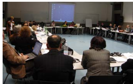
First EpiSouth Project Meeting (Rome, 2007)

In occasion of the Year of the Mediterranean (2005), a number of countries that share the Mediterranean ecosystem and, as a result, have common public health problems, agreed to develop