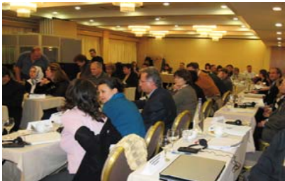
2° EpiSouth Project Meeting (Athens 2007)

ECDC-European Centre for Disease Prevention and Control, Stockholm, Sweden; EUROPEAN COMMISSION-DG SANCO Public Health Directorate, Luxembourg; MOH-Ministry of Work, Health and Social Policies, Rome, Italy; WHO–EMRO Regional Office for Eastern Mediterranean, Cairo, Egypt; WHO-EURO Regional Office for Europe, Copenhagen, Denmark; WHO-LYO Department of Epidemic and Pandemic Alert and Response, International Health Regulations Coordination, Lyon, France.