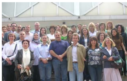
2° EpiSouth Training (Madrid 2008)