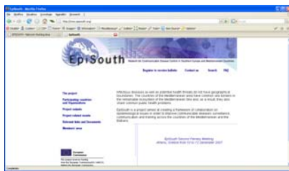
The EpiSouth website www.episouth.org

the project "EpiSouth", whose aim is to create a framework of collaboration on epidemiological issues in order to improve communicable diseases surveillance, communication and training across the countries of the Mediterranean and the Balkans. The Project "EpiSouth" started in October 2006 and will end on June 20-10.