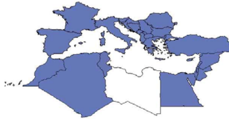
EpiSouth participating countries

Infectious diseases do not have geographical boundaries. Apart from a few for which a valid and efficacious vaccine is available, surveillance is the only instrument that public health (PH) personnel can use to contain the spread of epidemics.