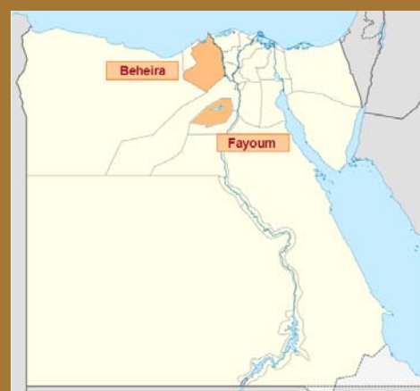
Map 2. Beheira, Fayoum governorates, Egypt