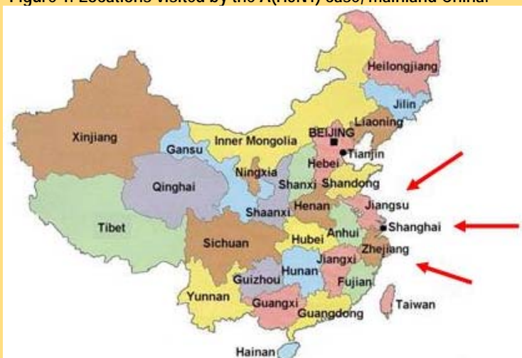
Figure 1. Locations visited by the A(H5N1) case, mainland China.